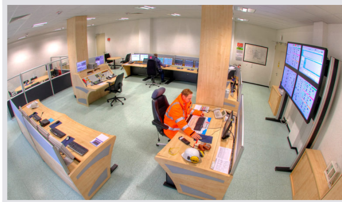
Gassco Dornum: New control center Photorealistic 3D planning and reality