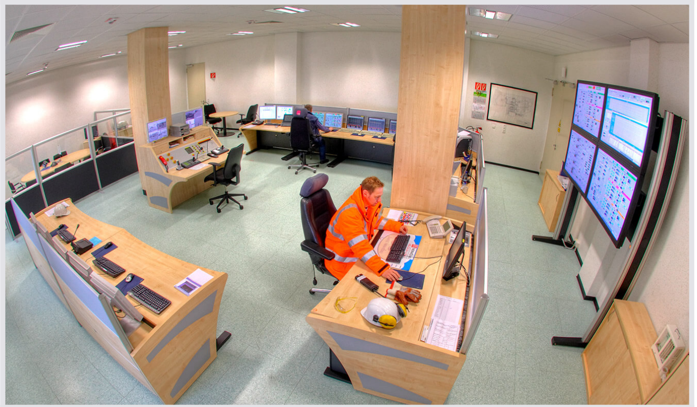
Gassco Dornum: New control center from JST

Dornum in East Frisia is extremely important for Europe's gas supply. This is because the Norwegian company 'Gassco AS', which is wholly owned by the Norwegian State, operates a gas landfall facility. In this plant, natural gas is transported by pipeline from Norway to Dornum and made available for the European market.