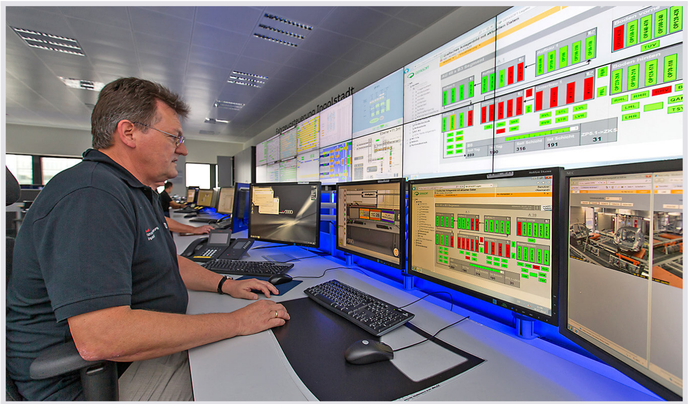
Audi Ingolstadt: Control center from JST

Stylish limousines, sporty allrounders and sleek coupes – more than 2,500 cars roll off the production line at the Audi plant in Ingolstadt every day, in 2013 more than 570,000 cars were produced here. To ensure that production never comes to a standstill, more than 30 employees in three shifts ensure that everything runs smoothly. Jungmann Systemtechnik – JST – has created the ideal conditions for this. A future-oriented control center has been installed at the Audi plant in Ingolstadt, which makes it possible to control the entire production of the various model series via virtual IT technology. A novelty in the Volkswagen Group, in which the new control center plays a highly regarded pioneering role.