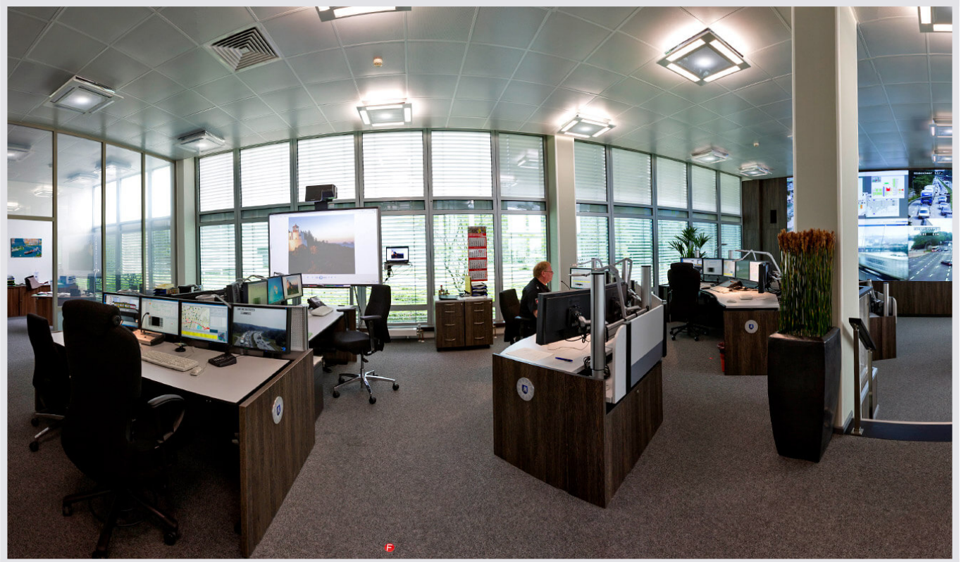
JST traffic control center: Panoramic view of the new Hamburg traffic control center

Greater safety on Hamburg's roads and better traffic flow on the routes of the Hanseatic city – two declared goals that will be achieved with the new, ultra-modern traffic control center at the police headquarters in Alsterdorf. With the professional support of the general contractor SWARCO TRAFFIC SYSTEMS GmbH and JST – Jungmann Systemtechnik® – used as subcontractor of SWARCO – the technical prerequisites were created.