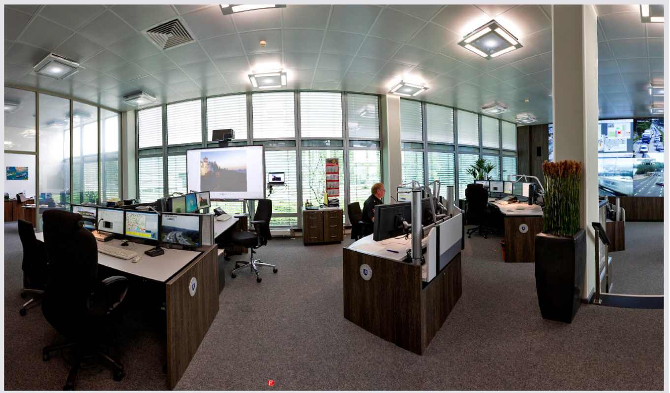
JST traffic control center: Panoramic view of the new Hamburg traffic control center

Greater safety on Hamburg's roads and better traffic flow on the routes of the Hanseatic city – two declared goals that will be achieved with the new, ultra-modern traffic control center at the police headquarters in Alsterdorf. With the professional support of the general contractor SWARCO TRAFFIC SYSTEMS GmbH and Jungmann Systemtechnik – used as subcontractor of SWARCO – the technical prerequisites were created.