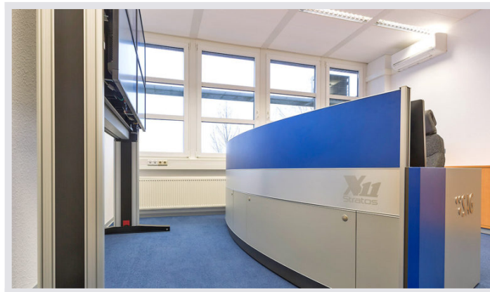
JST control center desks: The Stratos X11® OperatorDesk – shown here in the "Curve" version – meets the highest ergonomic and visual demands.