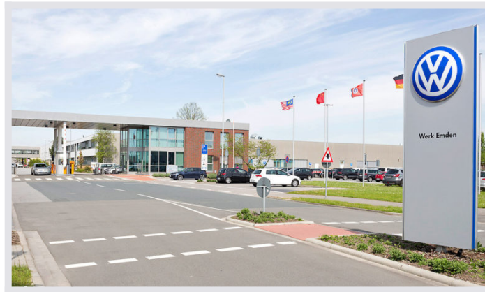
Entry area to the Volkswagen plant in Emden – up to 1,250 vehicles are produced here daily.

But controlling the wide variety of systems became increasingly difficult on small 19- or 24-inch monitors. Desire of the persons in charge: a large display wall , which clearly shows all components, thus making teamwork possible and ideally also visualises automated alarm activation.