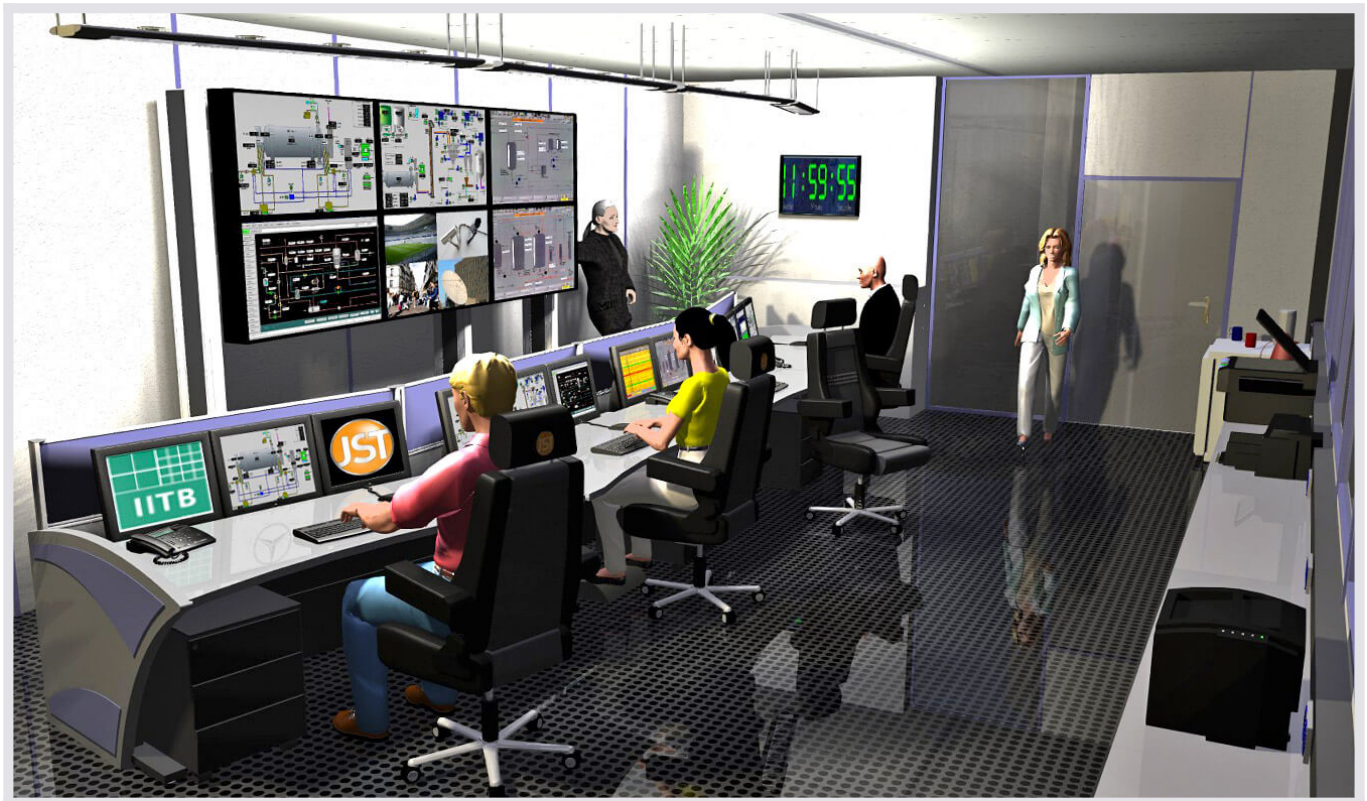
Daimler Bremen: New production control center. Photorealistic 3D planning.

The Mercedes-Benz plant in Bremen builds the C-Class models and the roadsters of the SL and SLK and CLK series. The press shop at the Bremen plant produces the sophisticated body parts for this. One of the most modern production control centers was put into operation in the press plant in Bremen. From here, all processes of pressed part production are monitored and the supply of blanks and the removal of offcuts is controlled.