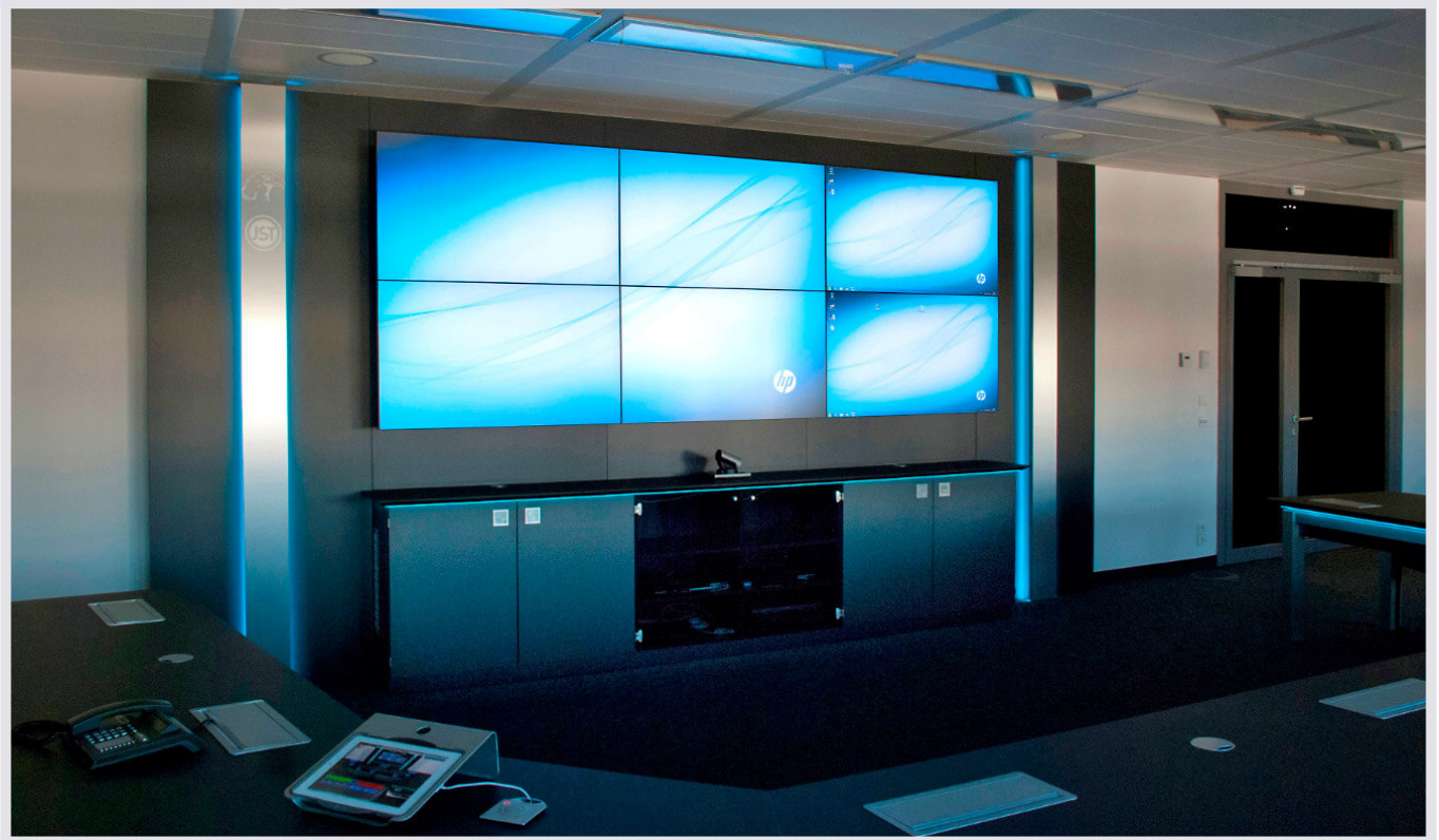
JST Conference Room - All participants of a meeting have an optimal view of the newly installed large display wall.

When it came to setting up a new monitoring room at a Siemens site in southern Germany, the specialists from JST – Jungmann Systemtechnik® first had to prove to the IT expert that you were the first choice among possible suppliers. Today, he looks back on this first phase of getting to know each other and comes to the conclusion: “That was just right”.