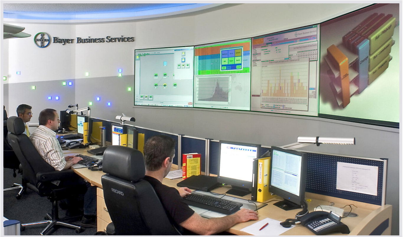
Control center of the Global Data Center in Leverkusen

Bayer Business Services is the Bayer Group's international competence center for IT-based services.