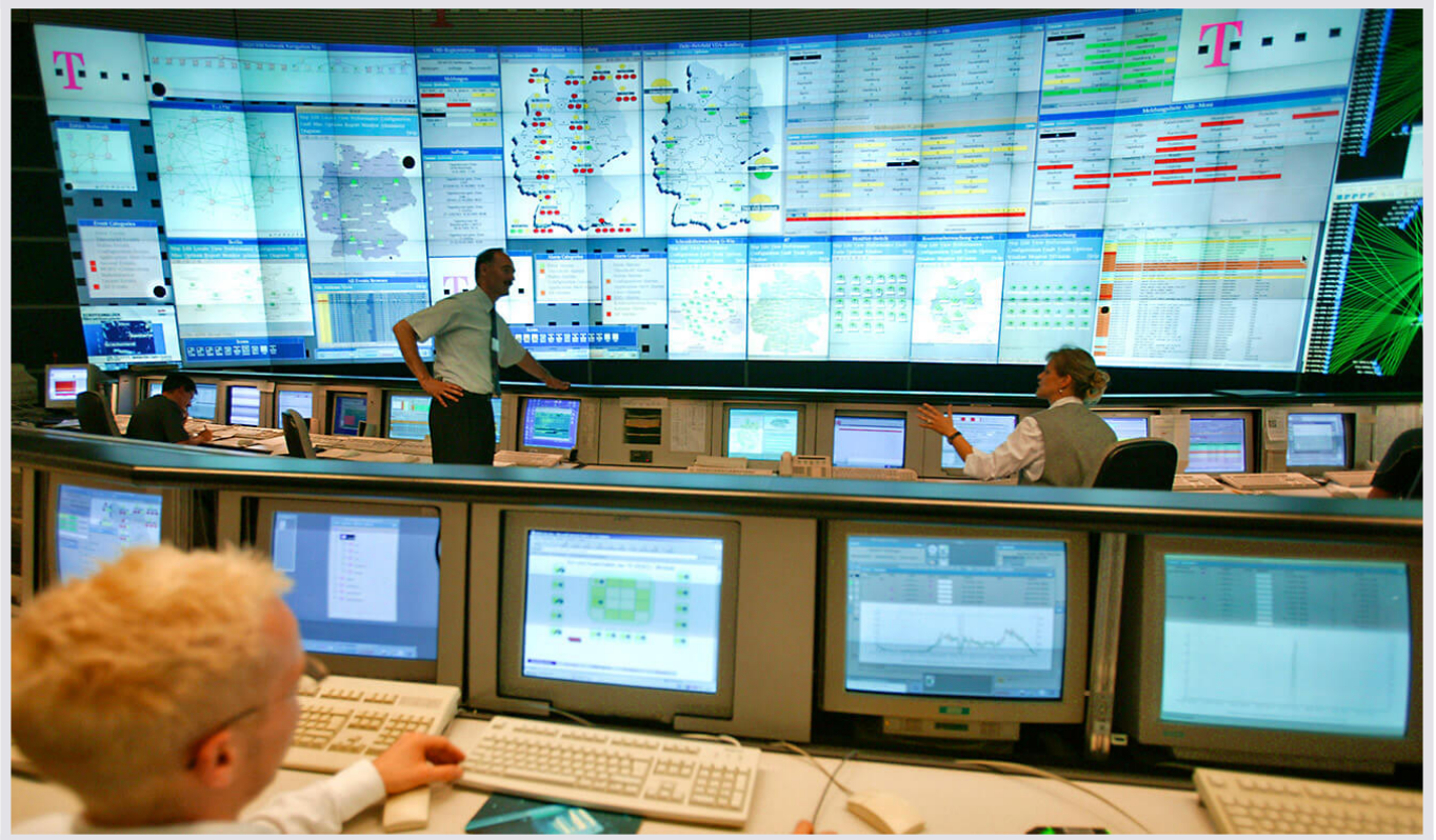
Deutsche Telekom Bamberg - Network Management Center from JST

The Network Management Center (NMC) has undergone a complete “facelift”. Jungmann-Systemtechnik was responsible for the entire planning , design and execution of the NMC.